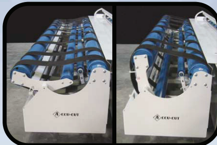
ADJUSTABLE, SQUARING CRADLE

Effortlessly provides full control over the material!