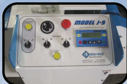
USER FRIENDLY CONTROLS

An auto-run feature makes operating the machine even simpler!