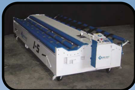
ONE PERSON OPERATION