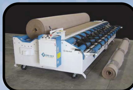
CUT PIECE REMOVAL

All Accu-Cut machines are equipped with a cut piece dumping mechanism to off load your cut length.