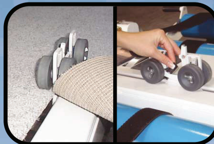
FAST, STRAIGHT CUTS

Patented, two direction, chain driven cutter uses standard blades and applies pressure to the material being cut.