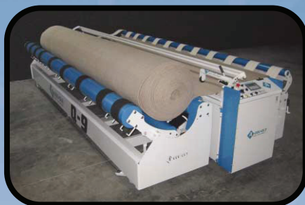
ONE PERSON OPERATION