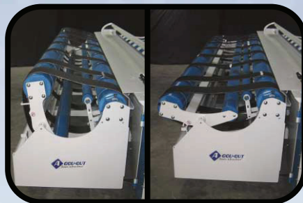
ADJUSTABLE, SQUARING CRADLE

Effortlessly provides full control over the material!