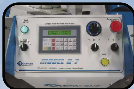
USER FRIENDLY CONTROLS

An auto-run feature makes operating the machine even simpler!