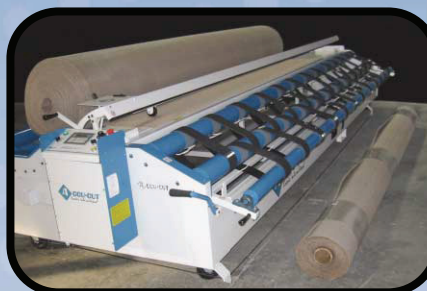
CUT PIECE REMOVAL

All Accu-Cut machines are equipped with a cut piece dumping mechanism to off load your cut length. Make multiple cuts off of one roll without using your forklift to remove the cut length!