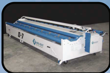
ONE PERSON OPERATION