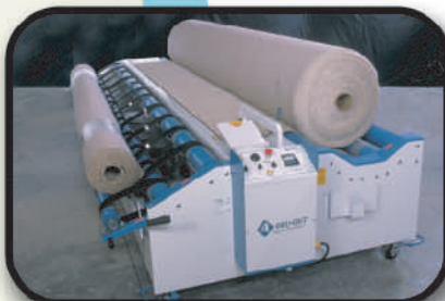
CUT PIECE REMOVAL

Make multiple cuts off of one roll without using your forklift to remove the cut length!