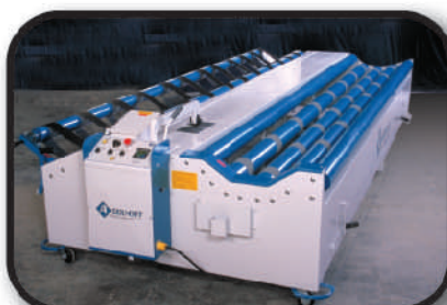
ONE PERSON OPERATION

Wrap around foot cable control, spring loaded roll up arm and cut piece dumping mechanism provide for ease of use.