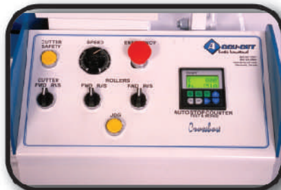
ADVANCED VARIABLE SPEED

'Infinite' speed control dial directs the variable frequency drives which automatically adjust each cradle to the proper speed.