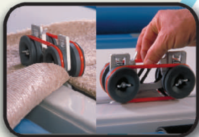
FAST, STRAIGHT CUTS